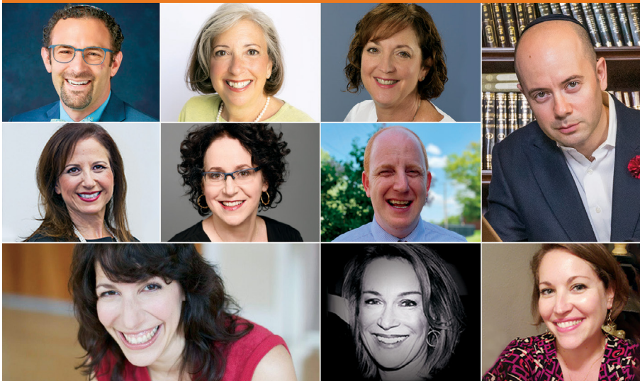
Spertus Institute is a partner with the Jewish United Fund in serving our community.