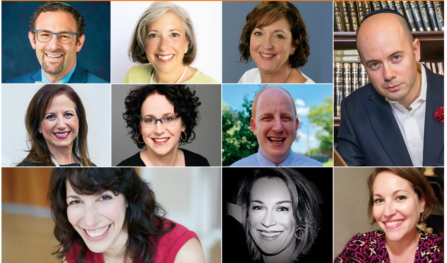
Spertus Institute is a partner with the Jewish United Fund in serving our community.