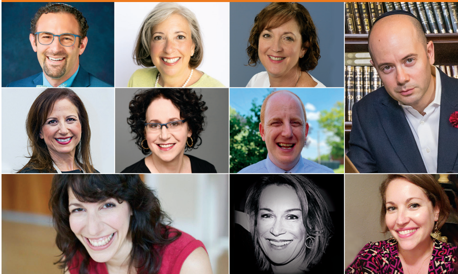
Spertus Institute is a partner with the Jewish United Fund in serving our community.